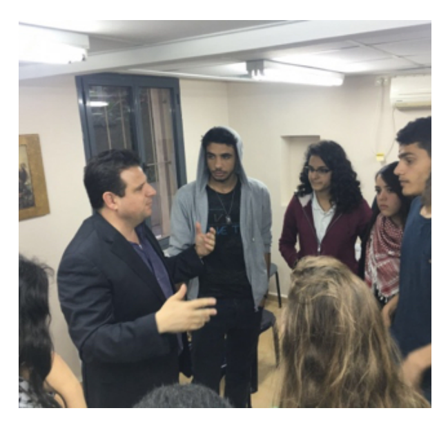
MK Ayman Odeh addresses "Let's Make a Difference" youth.