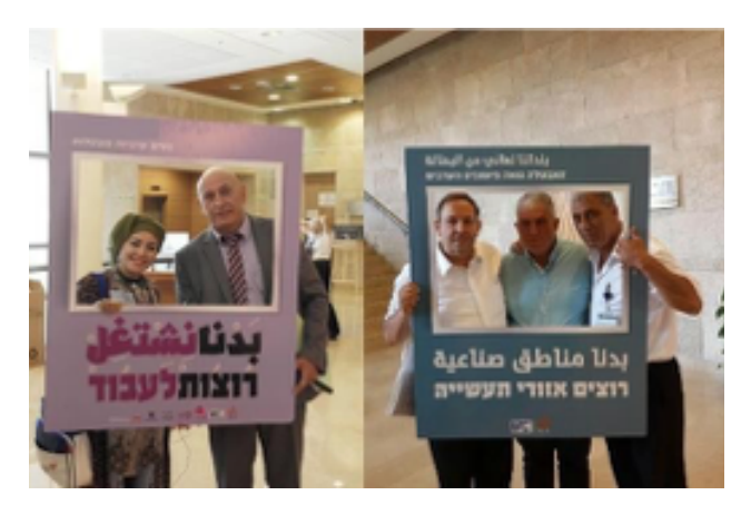
Members of the Arab community calling on the Knesset to address disproportionate unemployment, which results largely from a lack of industrial zones in Arab localities. The sign on the left reads, "We want to work." The sign on the right reads, "We want industrial zones."