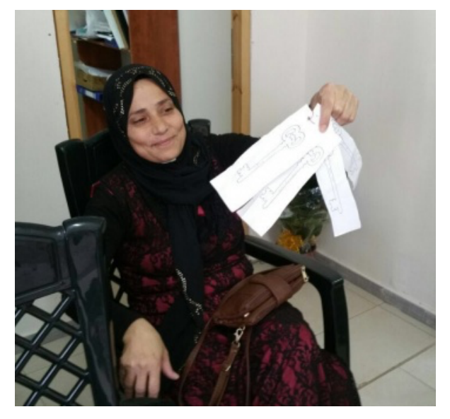
Participant in one of Mossawa's anti-poverty workshops.

Jisr az-Zarqa is one of the poorest towns in Israel, with high rates of unemployment and low academic achievement. Jisr al-Zarqa is boxed in by the ocean, a major highway, a nature preserve, and the wealthy town of Caesarea. As Jisr al-Zarqa's population grows, the town is unable to expand, causing overcrowding and heavy strains on social services and public infrastructure. Despite its prime location on the Mediterranean Sea, the village's economic growth has been suffocated. The Israeli government has failed to approve or collaborate on plans to improve the quality of life in Jisr al-Zarqa.