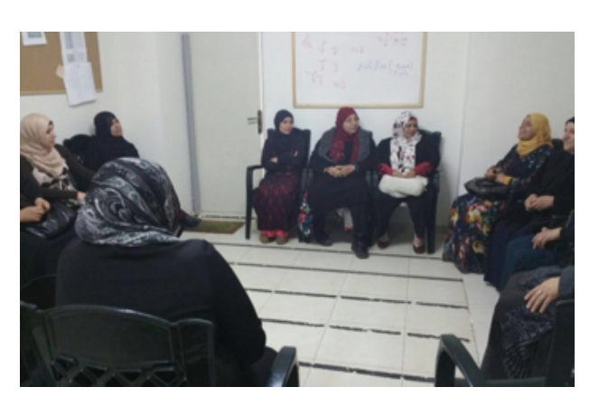
Arab citizens of Israel attend one of the Mossawa Center's poverty alleviation workshops.

The Mossawa Center and Jisr az-Zarqa's local council hosted a workshop to create an intervention plan for the village. The local council, concerned members of the community, and representatives of government ministries discussed strategies to capitalize on the village's untapped potential. Keynote speaker Martin Luther King III, son of the late civil rights leader, drew parallels between the African American civil rights movement and the situation of the Arab community in Israel. The workshop created a framework for investing in the village's economic potential.