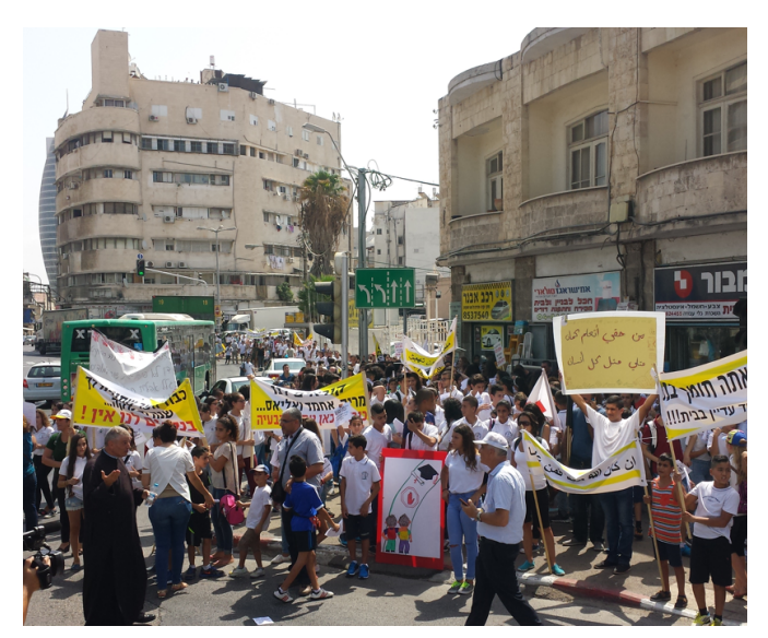
Members of the Arab community protest discriminatory funding in education.

Mossawa, the National Committee of Heads of Arab Local Authorities, and the Arab Center for Alternative Planning hosted a roundtable on planning and building issues in the Arab community. The Israeli government's failure to cooperate with Arab localities on planning has rendered many Arab localities incapable of issuing building permits. As a result, many Arab families are forced to build illegally. Arab municipalities have recently suffered a spate of home demolitions as the Israeli government intensifies enforcement of planning and building laws. The roundtable participants discussed the discriminatory Kaminitz Law, which will increase home demolitions in the Arab community and further criminalize unauthorized construction. The Mossawa Center has been a key partner for Arab municipalities seeking state funding to update master plans,