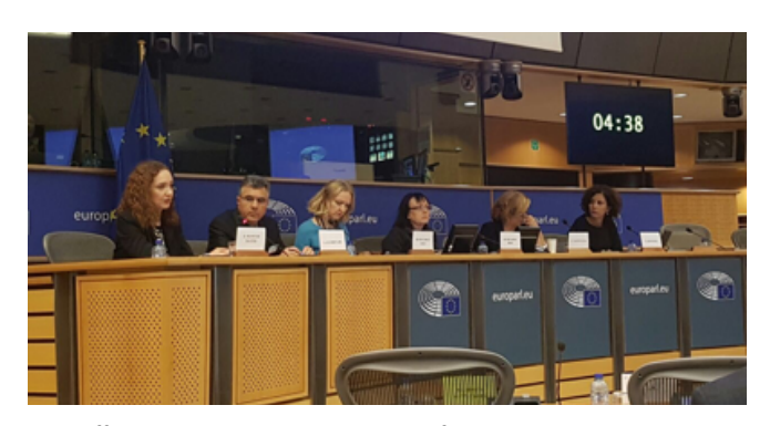
EU officials discuss the situation of Arab citizens in Israel with the Mossawa Center in Brussels.

The European Parliament also invited the Mossawa Center to provide an expert testimony in a hearing in the EU Subcommitteee on Human Rights on the rights of Bedouins in Israel and Palestine. The Center demanded that the EU take actions to prevent further home demolitions and the forced displacement of the Bedouin community.