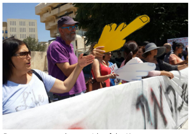
Demonstrators gather outside of the Knesset to protest poverty in the Arab community.

In addition to advocacy efforts to hold the government responsible for the poverty in Israel and the Arab community, Mossawa also worked with Arab communities to identify opportunities to alleviate poverty. Mossawa, in cooperation with the Freidrich Ebert Foundation and the